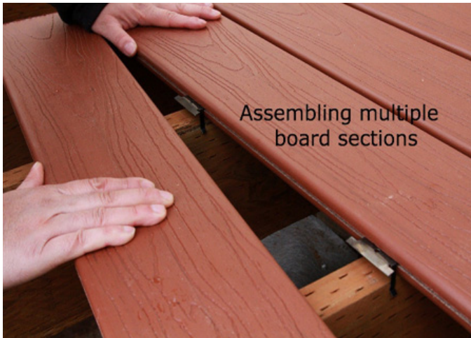
Assembling multiple board sections