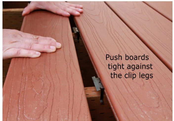
Push boards tight against the clip legs