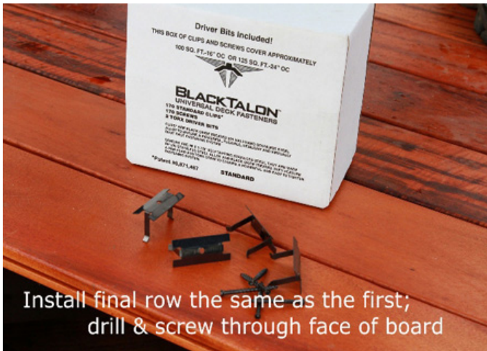
Install final row the same as the first; drill & screw through face of board