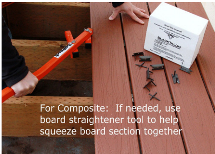
For Composite: If needed, use board straightener tool to help squeeze board section together