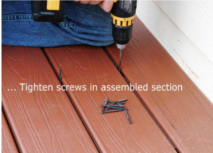
... Tighten screws in assembled section